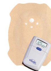
Kalypto Medical NPD 1000

The Kalypto Medical dressing forms to the skin surrounding the wound with a cohesive gel, which tends to maintain structure during use. This may reduce the risk of periwound maceration, by preventing fluid from tracking through the dressing.